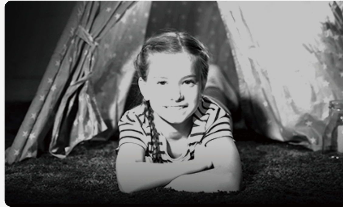
Without Smart IR

With Smart IR, the intensity of the infrared LEDs automatically adjusts to prevent overexposure in night vision mode, so you will get more details of the object or person captured at night.