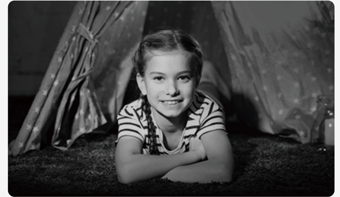
With Smart IR