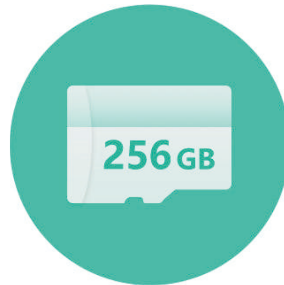
Supports MicroSD Card

*Cloud storage service is only available in certain markets. Please verify the availability before making any purchase.