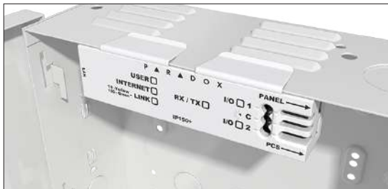
IP150+ Installed in a Metal Box